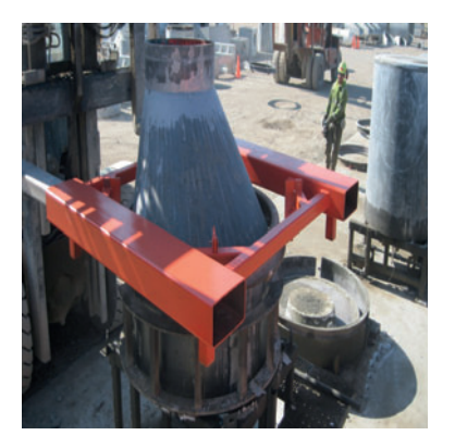
A forklift attachment allows the operator to set the header and pallets in a safe and efficient manner