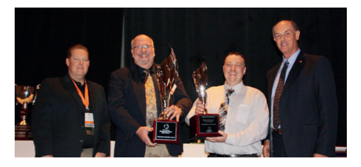
Overall, individual location and company-wide winner of 2016 Chairman's Quality Award was presented to Northern Concrete Pipe Inc. at 2016 AGM in Hilton Head, SC.

The American Concrete Pipe Association offers an on-going quality assurance program to member and non-member companies. Under the "Quality Cast" Plant Certification Program, known as QCast, the inspection of materials, finished products and handling/storage procedures, as well as performance testing and quality control documentation is managed by independent inspectors. Plants in each of the certification categories that score 95% or better on their annual QCast audit are recognized with the QCast Award. One overall winner is selected in each category. In 2016, the Chairman's Quality Award was presented to Northern Concrete