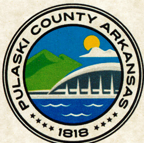
County Judge/Chief Executive Officer

The County of Pulaski officially recognizes the week August 20-26, 2017 as Concrete Pipe Week; and I urge all our people to join with representatives of the Arkansas Concrete Pipe Association and the American Concrete Pipe Association in activities and ceremonies designed to pay tribute to our reinforced concrete pipe and precast concrete industry producers, associate members, and all Pulaski County employees associated with this industry and the infrastructure these businesses require and to recognize the substantial contributions they have made to our health, safety, welfare and quality of life.