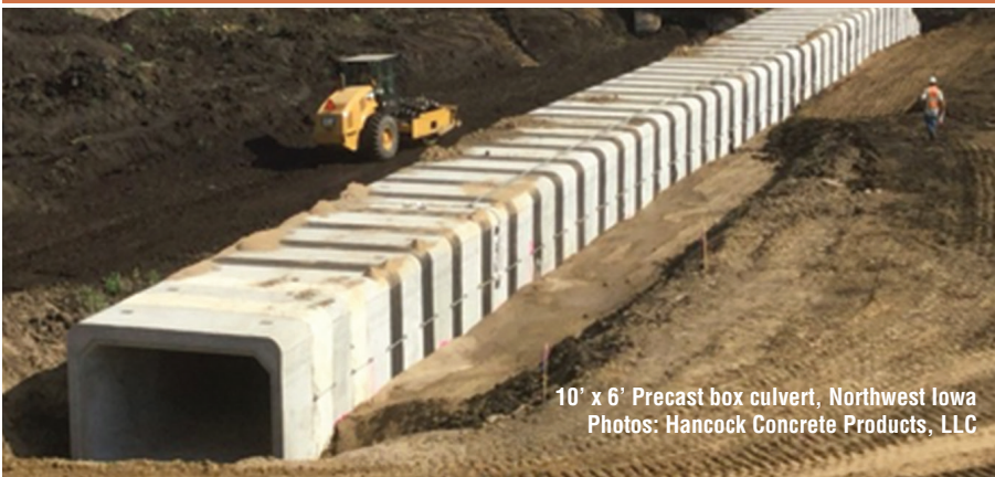
10' x 6' Precast box culvert, Northwest Iowa