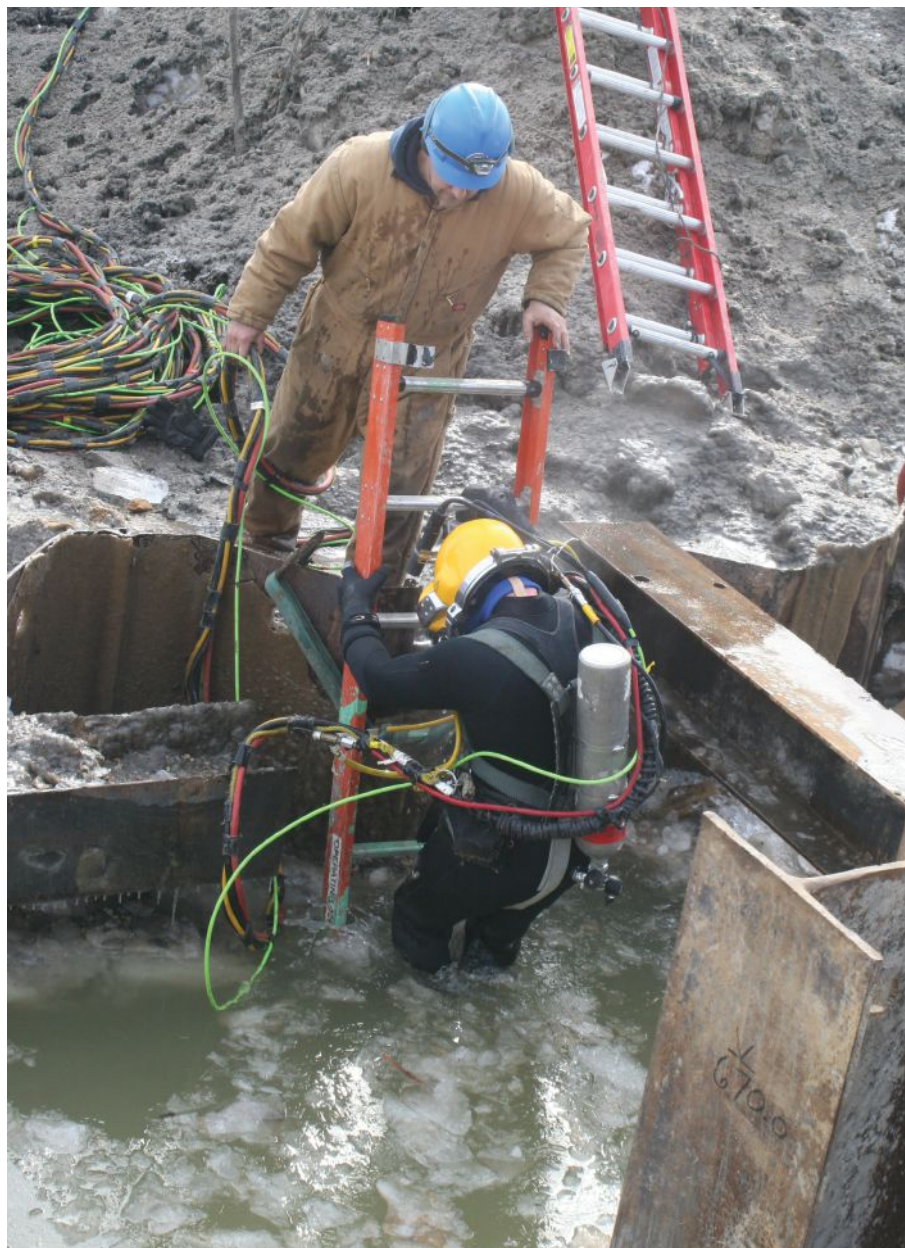
The outlet pipe was weighted down by concrete collars under the riverbed and filled with water.

The third chamber polishes the filtered water and leads to an outlet pipe that releases the water back into the stormwater drainage system at predevelopment flow rates. Some