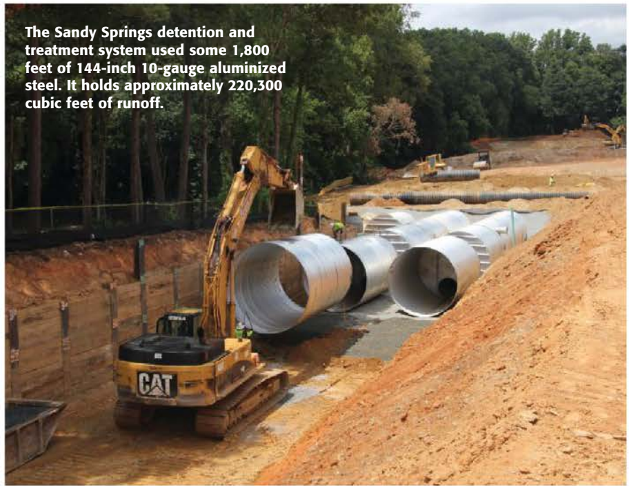
The Sandy Springs detention and treatment system used some 1,800 feet of 144-inch 10-gauge aluminized steel. It holds approximately 220,300 cubic feet of runoff.

GFIA was not permitted to install the pipe when the course was in use,