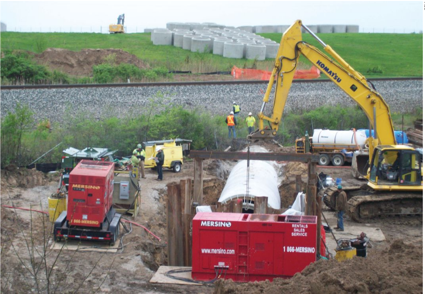
Concrete pipe ran under a railroad, a local road, several access roads, an expressway, and a golf course, and over two streams.

GFIA chose to install a new stormwater detention and treatment system on the east side of the airport and rerouted the stormwater from the west air carrier apron to the new system. From there, pipe takes the treated stormwater to a new outfall on the Thornapple River.