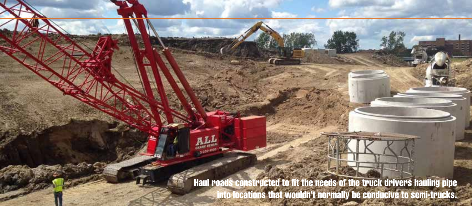
Haul roads constructed to fit the needs of the truck drivers hauling pipe into locations that wouldn't normally be conducive to semi-trucks.

arrived. Miller Bros. adapted the haul roads to fit the needs of the truck drivers hauling pipe into locations that wouldn't normally be conducive to semi-trucks.