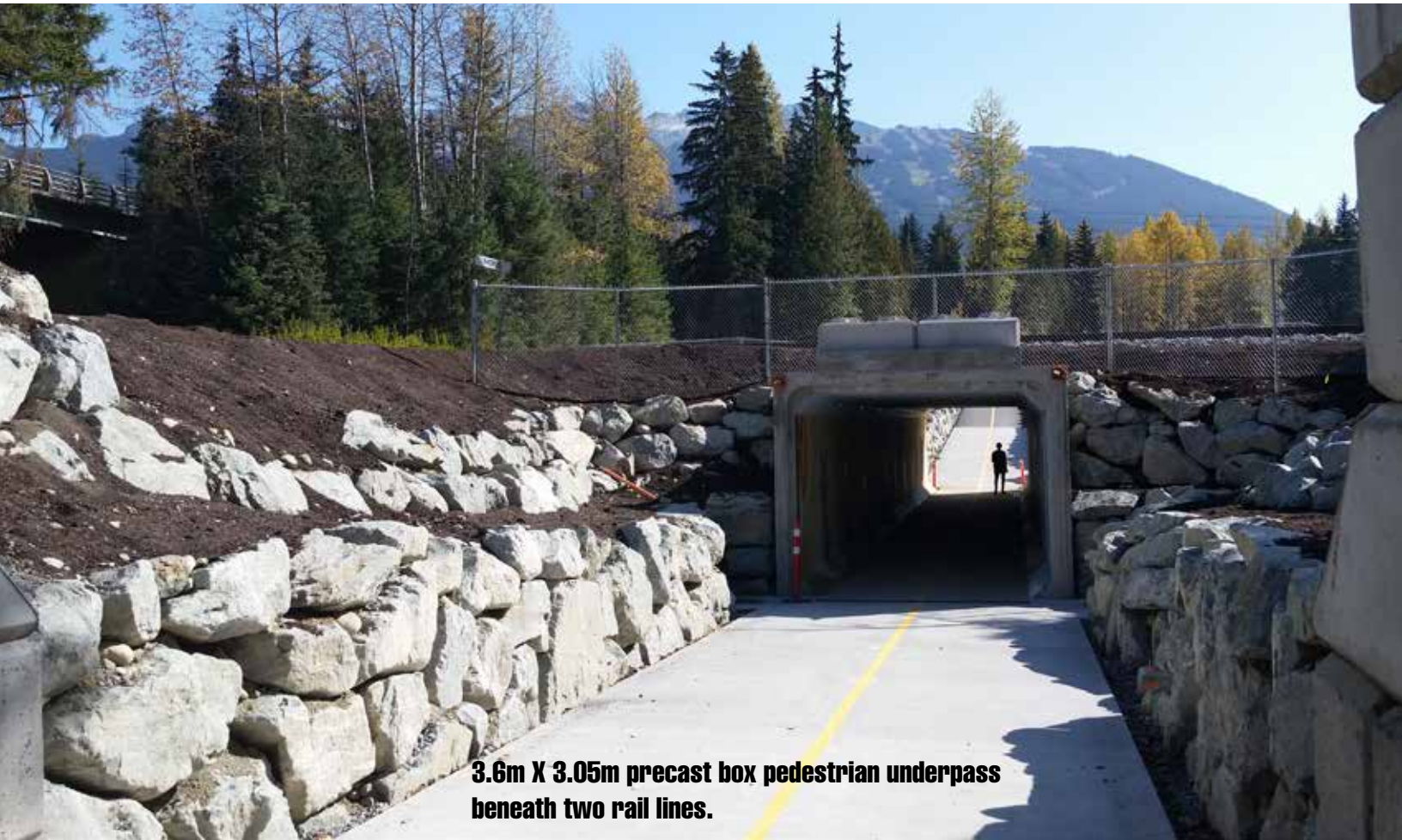
3.6m X 3.05m precast box pedestrian underpass beneath two rail lines.