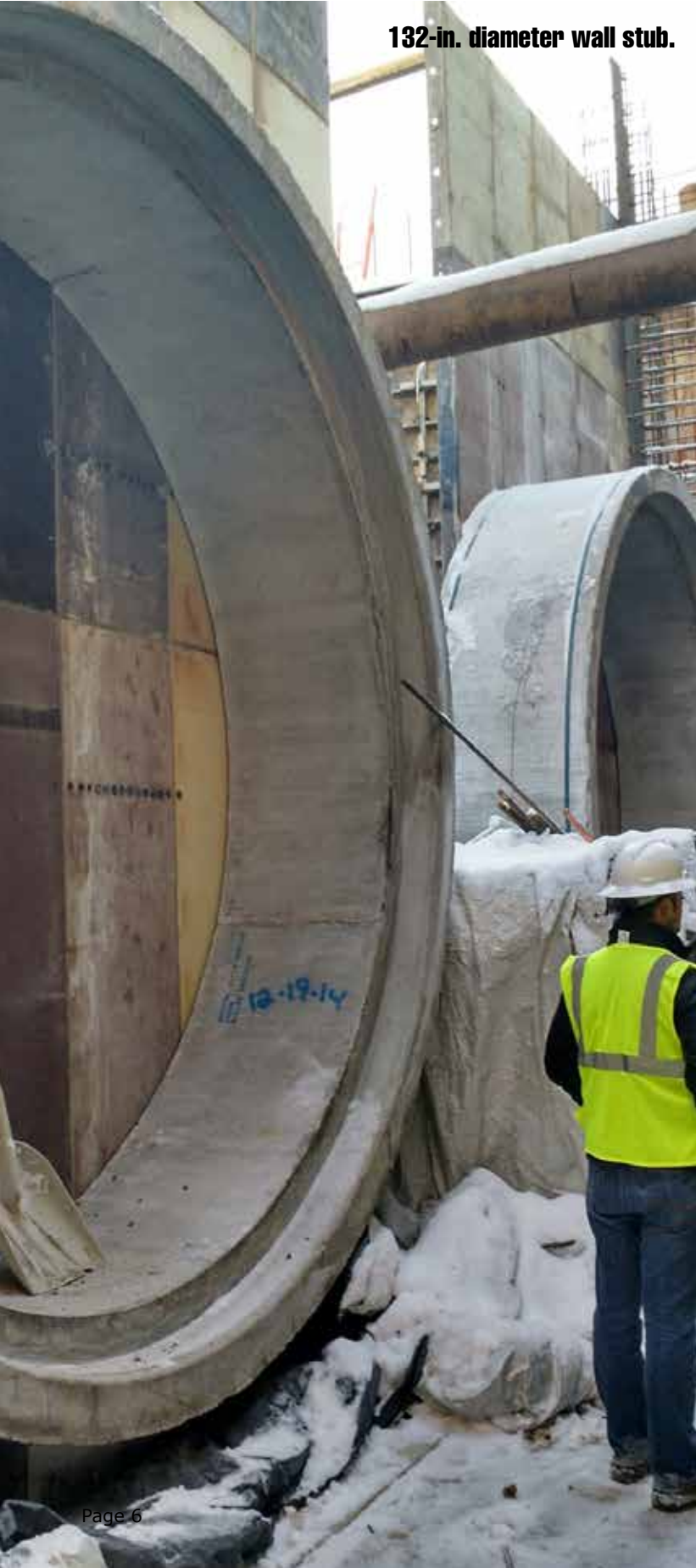
132-in. diameter wall stub.

The Dearborn Combined Sewer Overflow (CSO) Storage Pipeline is part of the ongoing Toledo Waterways Initiative. After startup in 2002, and when all phases are completed, it will eliminate all known sanitary sewer overflows and significantly reduce CSOs that release contaminants directly into local waterways during heavy rain. The Dearborn CSO Storage Pipeline will significantly reduce the combined sewage overflows to the Maumee River.