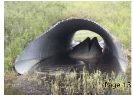
Failed corrugated steel arch culvert.