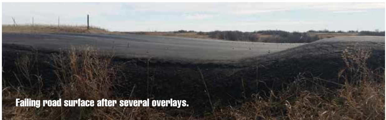
Failing road surface after several overlays.