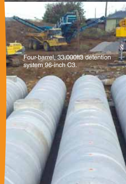
Four-barrel, 33,000ft 3 detention system 96-inch C3.