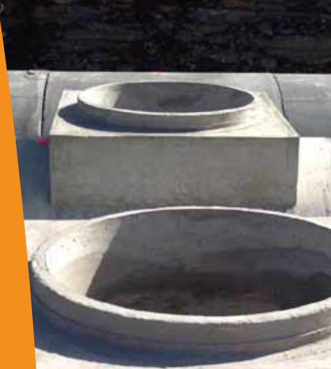
"Saddle-Tee" manholes in lieu of large precast junction boxes.