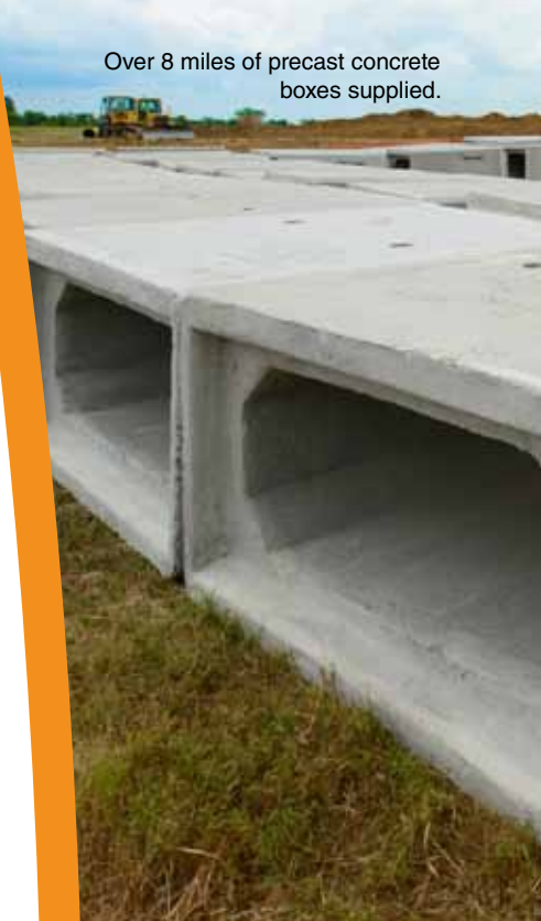
Precast boxes supplied for stormwater management.