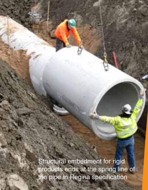
Structural embedment for rigid products ends at the spring line of the pipe in Regina specification