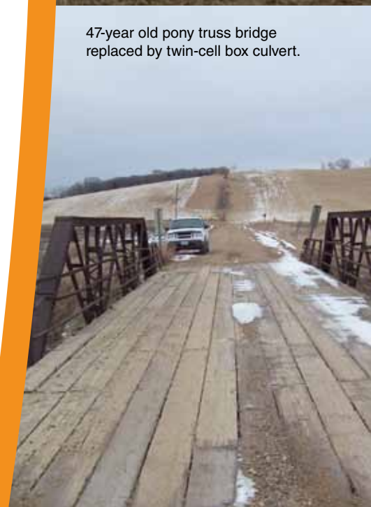
47-year old pony truss bridge replaced by twin-cell box culvert.