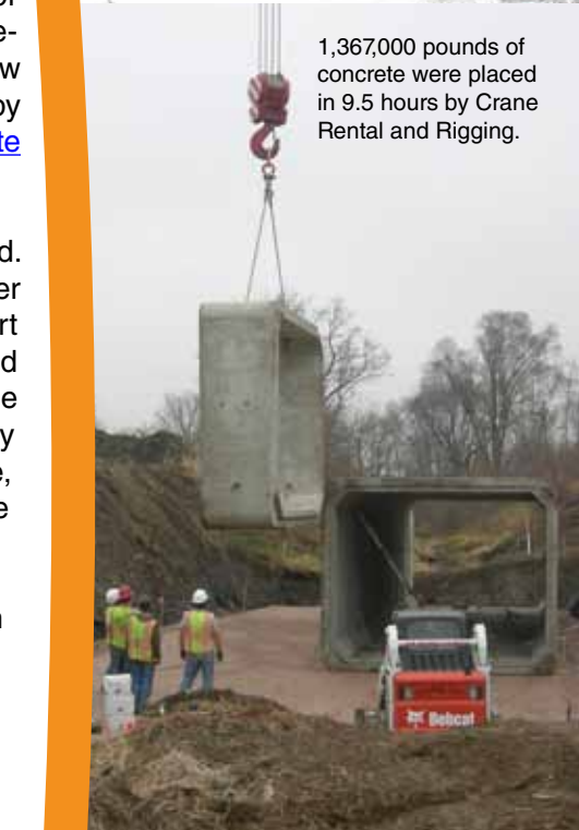
1,367,000 pounds of concrete were placed in 9.5 hours by Crane Rental and Rigging.