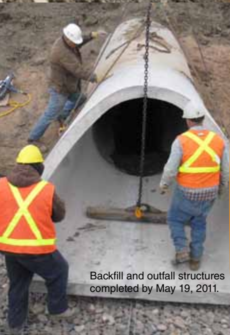
Backfill and outfall structures completed by May 19, 2011.