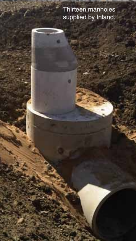
Thirteen manholes supplied by Inland.