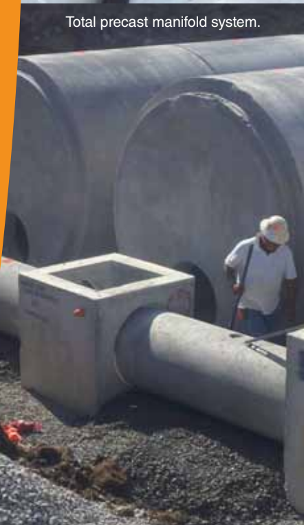
Total precast manifold system.