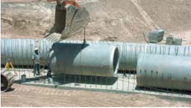
The 60-inch diameter ASTM C-351, C-50 reinforced concrete low-head pressure pipe is supported on a concrete slab and will be encased in concrete.

process”, where the inner core remains with the pipe for a minimum specified period. This technique helps lock the liner into the wall of the pipe by inducing the initial “set” of the concrete prior to removing the inner mold.