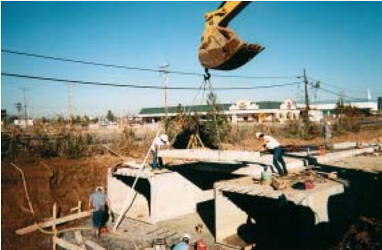
Installation crews positioned the "link slabs" atop the precast rectangular box sections.