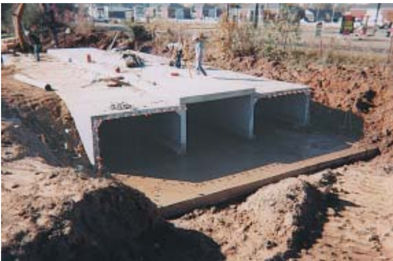
All box sections and link slabs were set in only 17 hours, reducing project manpower requirements and on-site equipment expense.

of culverts are standard four-sided rectangular box culverts. These two outside culverts, spaced nine feet apart – inside wall to inside wall – are linked by a precast flat slab. This design uses the inside walls of the other box sections for support of the slab.