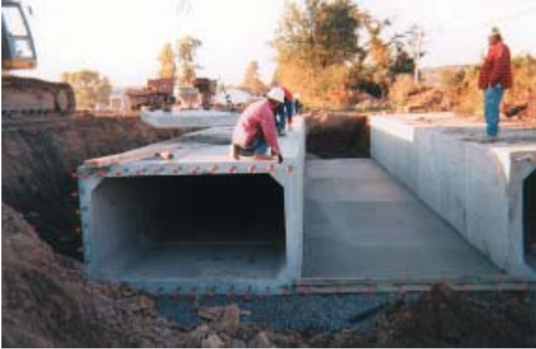
Two rows of precast concrete box sections, spaced nine feet apart, serve as the outer most structure of the multi-cell drainage culvert.