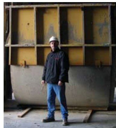
Standard 84-inch diameter RCP prepared for wet cast of pre-bed.