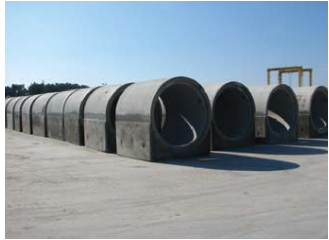
Pre-bed pipe prepared for shipment.

Foley Products was able to produce and ship the pre-bed pipe within a short period to meet the contractor's schedule for installing the pipe. The company was able to produce the pipe in its dry cast facility one day, and then lay the pipe down the next day in its wet cast plant to pour the pre-bed. Production of the pipe from start to delivery took only 14 days. Dennis Morrissey, Operations Manager, handled all aspects of the production process from the dry cast pipe to the wet cast pre bed. The project started in August and ended in November of 2006.