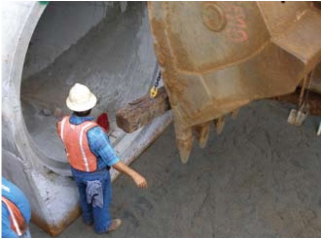
Pre-bed pipe homed into position.

fer a rigid product to the owner and stay within an economically feasible budget. The design allowed for the use of existing manufacturing equipment and eliminated the additional retooling that would have been required had a conventional pipe bedding been constructed in the field. Retooling would have meant investing in equipment that would produce thick wall pipe, and usually has to be built into the pipe price, since it may never be used again. Even with the sub trench installation that was specified, 60 feet of fill is a daunting challenge, especially when it is part of airport infrastructure that once built, has to be function uninterrupted for the life of the facility.