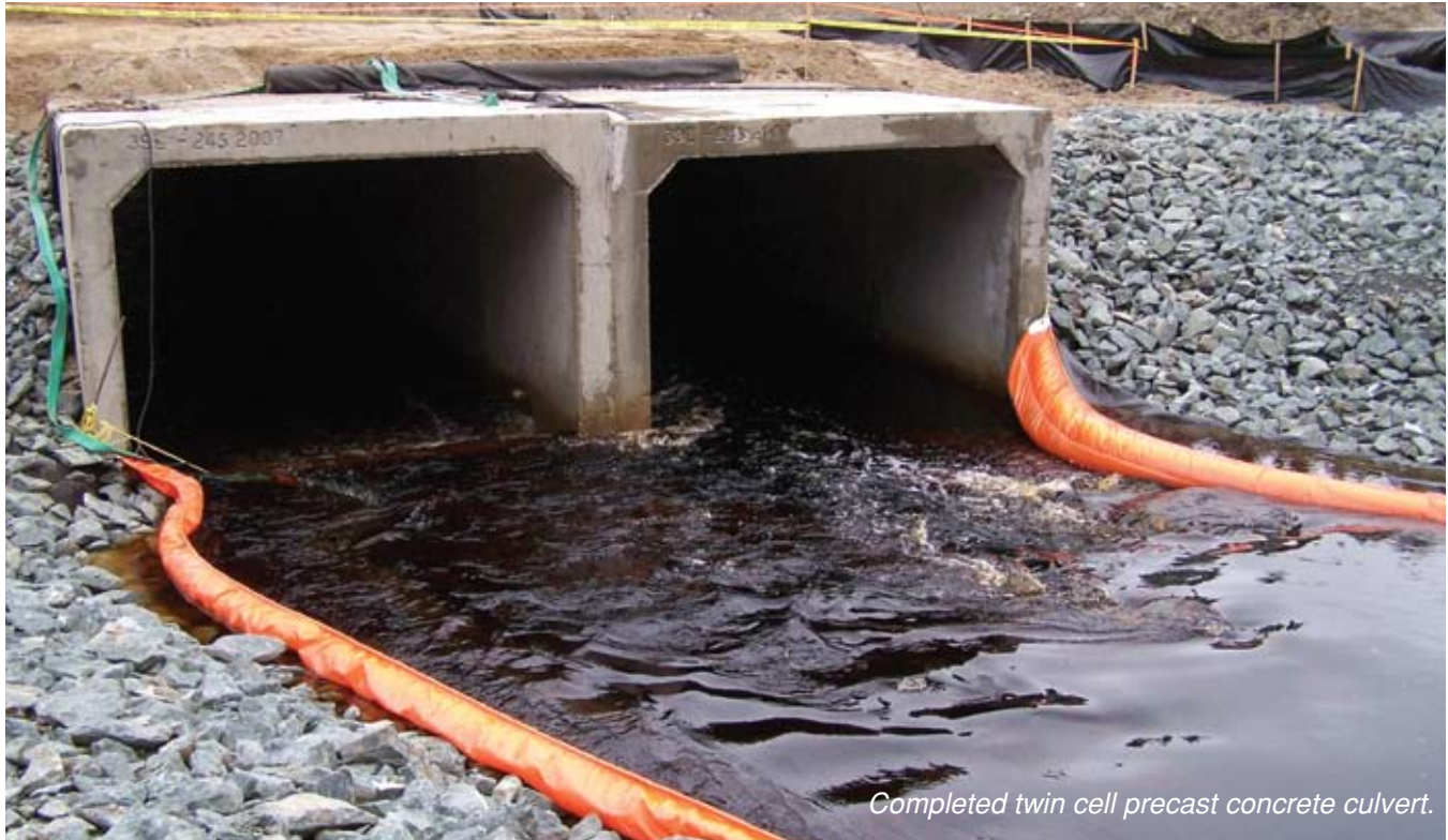
Completed twin cell precast concrete culvert.

Although standard sized, the boxes were specially designed to the Canadian Highway Bridge Design Code to accommodate additional reinforcement and to meet the engineering design of the structure to carry the heavy loads of the road and traffic. Once installed, the culvert had to perform for at least the design life of the road and require low maintenance, because the highway must be open year-round for emergency and service vehicles, as well as local traffic.