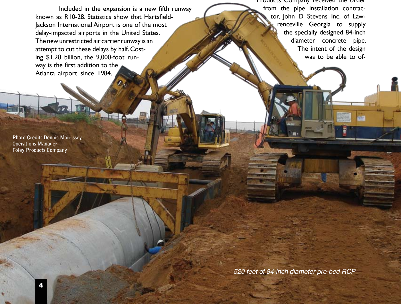
520 feet of 84-inch diameter pre-bed RCP