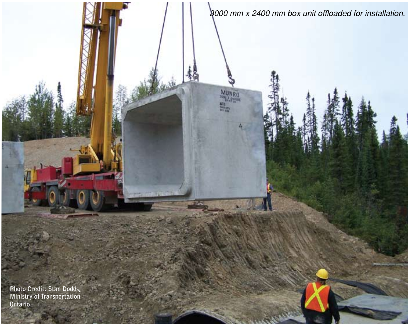
3000 mm x 2400 mm box unit offloaded for installation.

Highway 634 is a long and isolated bush highway that connects the Abitibi Canyon hydroelectric dam on the Abitibi River at the community of Fraserdale with the rest of the province. It also serves the small community of Smooth Rock Falls at its southern terminus where it connects to Highway 11. The 80-kilometer highway is a vital north-south link for northern communities and access road to a major hydroelectric plant owned by Ontario Power Generation.