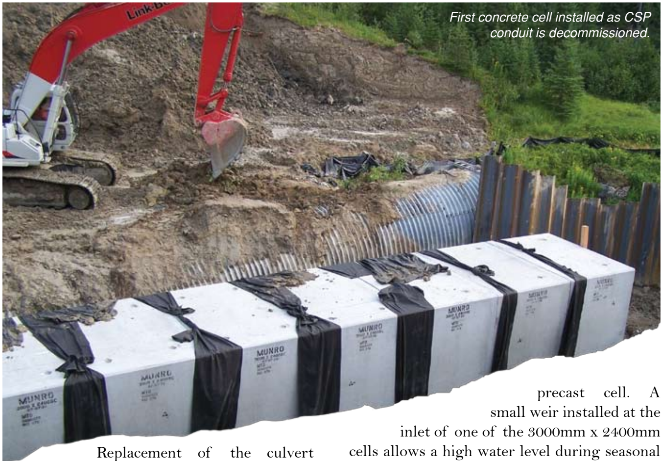
First concrete cell installed as CSP conduit is decommissioned.

Replacement of the culvert with a precast concrete structure was specified because of the proven service life (durability) of precast concrete boxes, low maintenance of the culvert over the design life of the project, and the ease of installation of the units. Early purchase of the concrete box units from Munro Concrete Products Ltd. in Utopia, near Barrie, provided the Ministry of Transportation with additional time to complete any remaining engineering work associated with the tender for the road works.