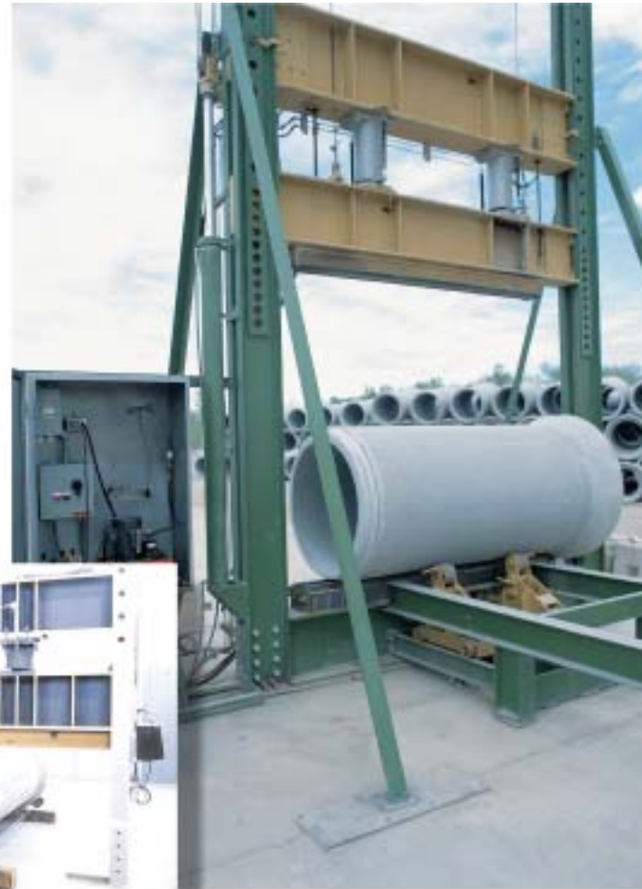
Concrete sewer and culvert pipes are designed to meet a specific cracking load.

W.J. Schlick of Iowa State University established the 0.01 -inch crack width using a 0.01-inch thick leaf gauge to provide a measurable and definitive crack size for the three-edge bearing test. Eventually, the 0.01-inch (0.25 mm) crack became the accepted criterion for pipe performance.