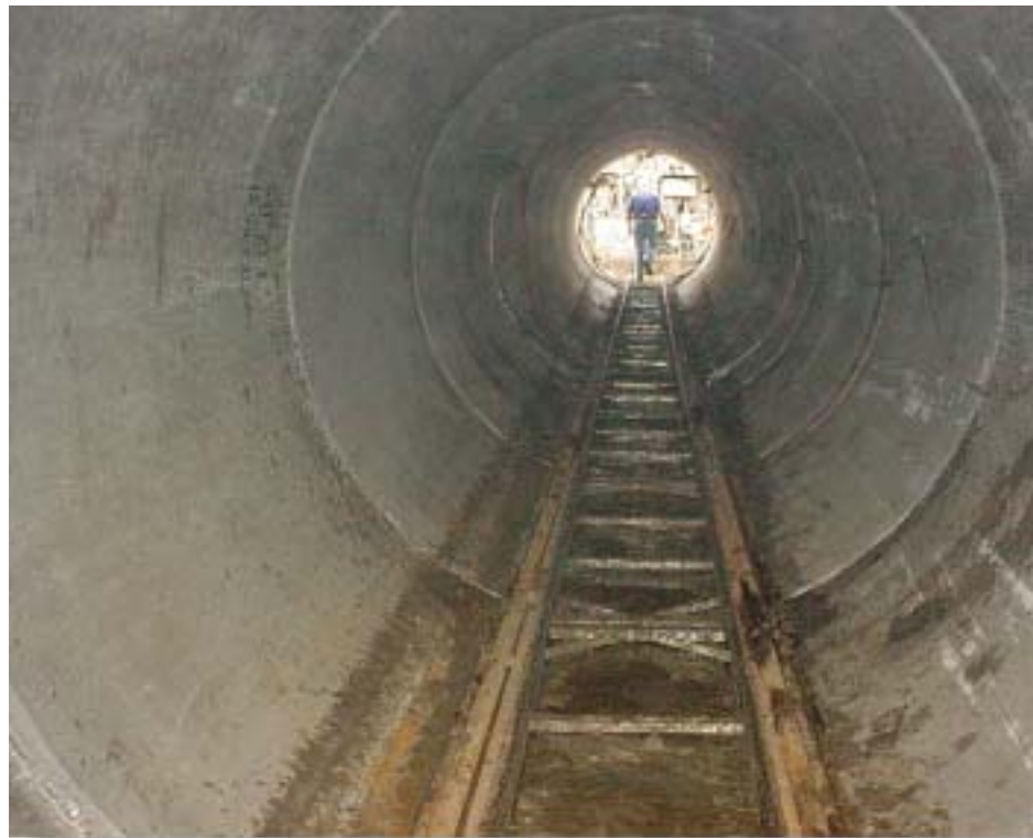
Large diameter RCP accommodated changes in volume of runoff over past 50 years and imperviousness of the drainage area.

RCP was jacked into place at every valley along the route using diameters ranging from 12 inches to 96 inches. Some pipe was replaced with larger sizes because of changes