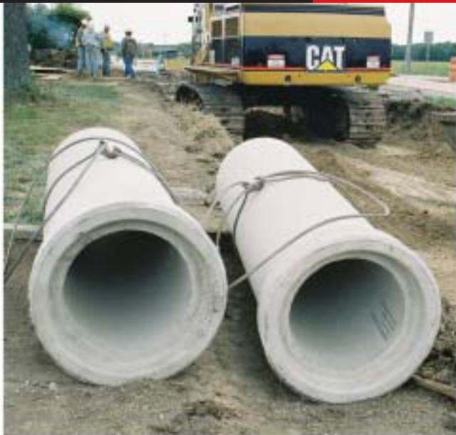
Reinforced concrete pipe ranged in size from 12 to 92 inches in diameter.

prices, and the ability to provide on-time deliveries prompted Zito Construction, D'Alessandro Contracting Group and D'Agostini & Sons, Inc. to choose the Premarc Corporation of Durand, Michigan to supply reinforced concrete pipe for certain sections of their contracts. A major concern was the assurance of a watertight joint for all pipe units to limit migration of fine soil. Storm water inflow and groundwater infiltration had added to the sanitary flows that exceeded the capacities of these interceptors. By using diamond-tipped grinding wheels, Premarc produces exact dimensional tolerances during the manufacturing of the gasket-seating surface, ensuring dimensional control over the pipe joint. Construction crews are able to accurately install gaskets and home the pipe.