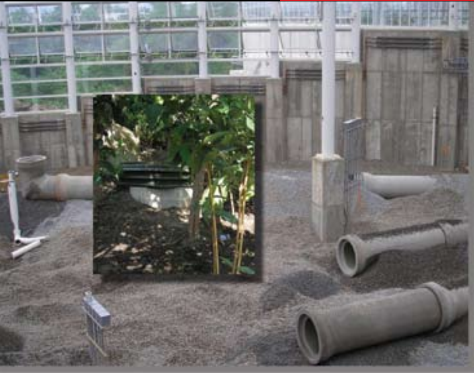
Earth tubes consisted of six runs of 24-inch diameter RCP for climate control of conservatory.

marine walls and small dams, standard boxes and pipe for animal and pedestrian crossings of rail lines and highways, tunnel systems for railways and raw material conveyances, storm water storage and retention chambers, small bridge structures, jacking and tunneling applications, and marine outfalls. New applications are limited only by the imagination of infrastructure designers.