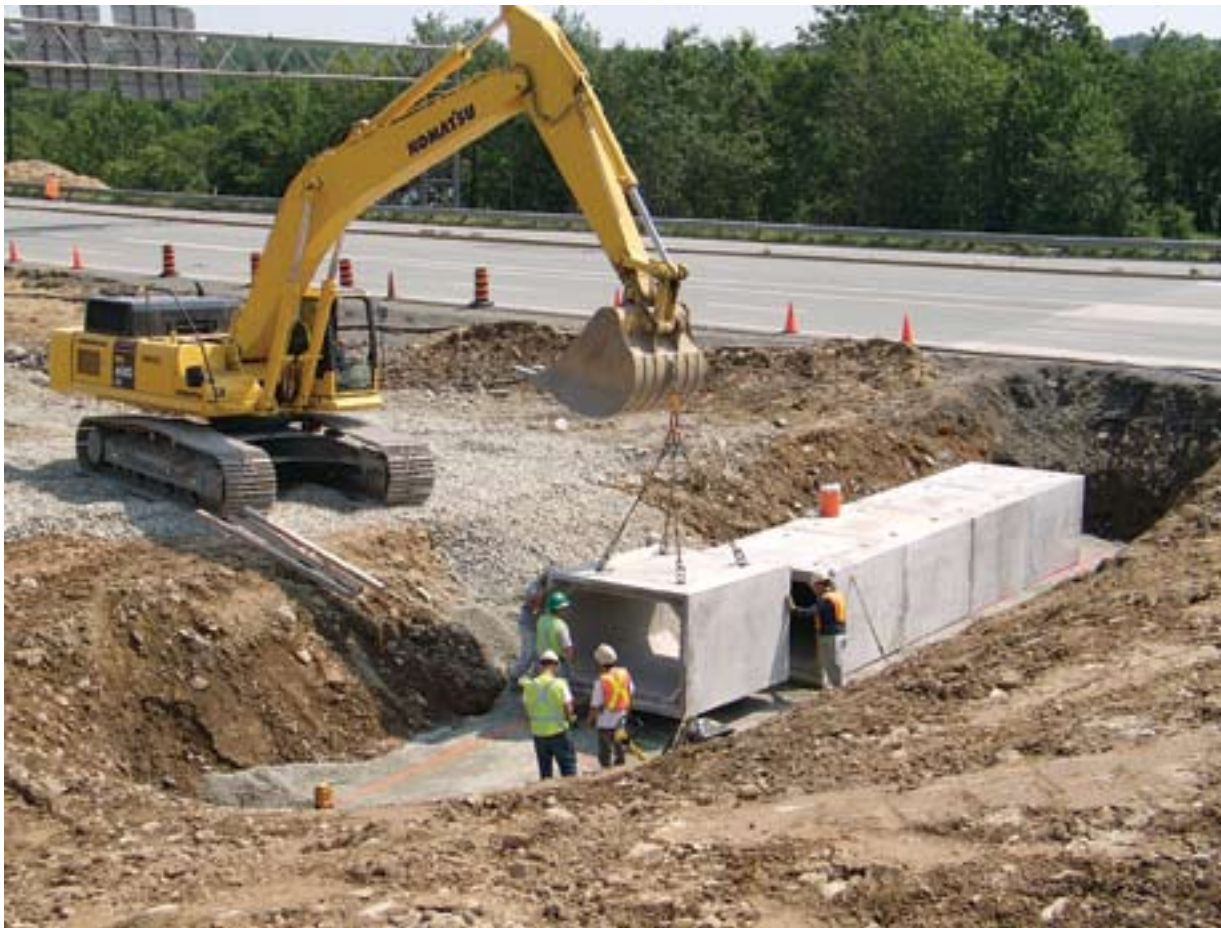
Standard and three-sided boxes used for culvert construction.

system on the Dartmouth side of Halifax Harbor, which is aptly named “the City of Lakes”. The former quarrying operations had diverted the natural water flow through a series of ditches and culverts, preventing the passage of fish between the lakes, thereby rendering the brooks virtually lifeless. The goal of the North American Development Group was to rehabilitate these waterways, so that fish and other aquatic animals and plants could be re-established.