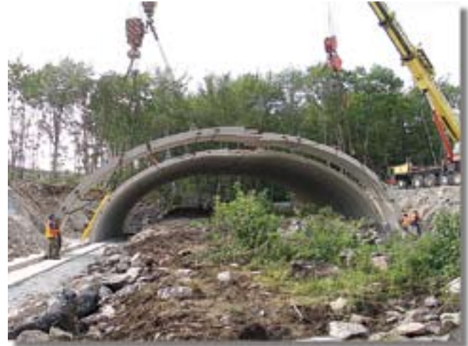
Precast concrete arch product used for stream crossing.

Shaw Pipe is a member of The Shaw Group Limited, one of Eastern Canada's leading diversified companies. Its primary businesses are in natural resource-based manufacturing and community development. Established in 1945, the company has been honored as one of Canada's 50 Best Managed private companies for the past six years. In addition to pipes, manholes, catch basins and culverts, the division also specializes in custom-designed products for unique applications. ShawSpan instant bridges and BEBO precast arches allow faster project completion, total quality control and environmental protection. Shaw Pipe also produced heavyweight stabilization mattresses to protect offshore structures. See www.shawgrouppltd.com for more information