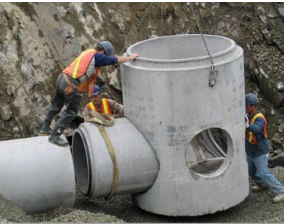
2,500 units of 36-inch diameter RCP shipped to project.