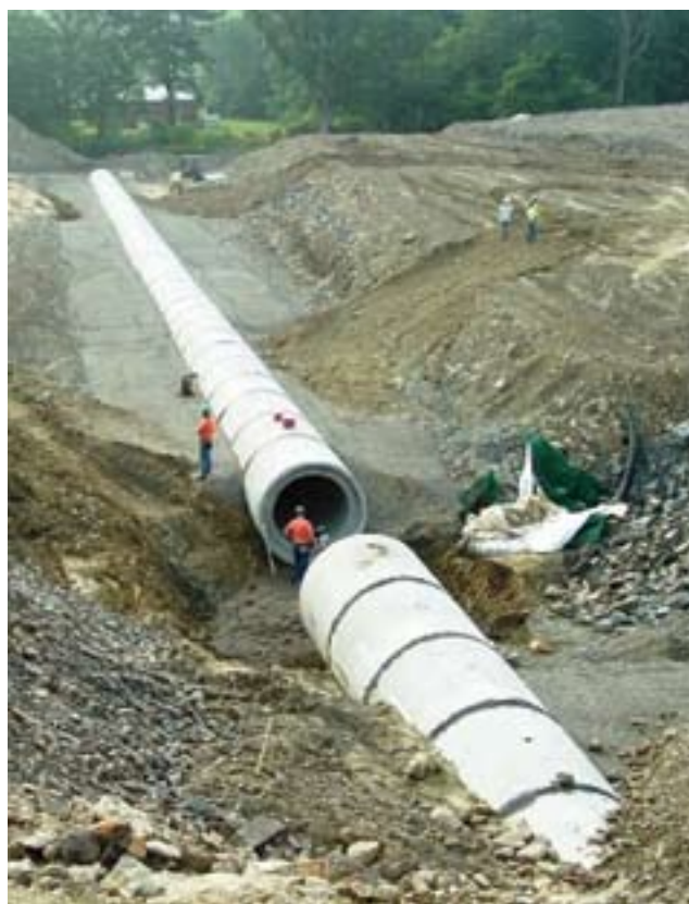
A 72-inch diameter RCP culvert constructed under 60 feet of fill on a section of U.S. Route 15 in Pennsylvania.

that every project include all culvert types as bid alternatives. With engineering and LCA (Least Cost (Life Cycle) Analysis) documentation, State DOTs can specify the appropri-