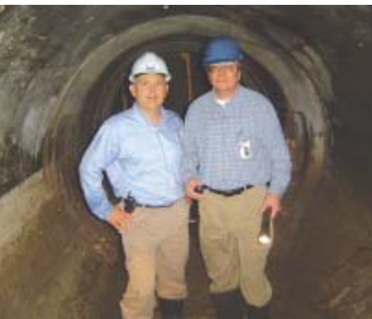
Inspection of 132-inch diameter RCP used for tunneled storm sewer.

The Metropolitan Sewer District of St. Louis has a service area of 524 square miles including all 62 square miles of the City of St. Louis. The current population served by MSD is approximately 1.4 million. The Grand and Bates Relief Phase II (Tunnel) project was a major initiative to reduce flooding and sewer backups. The concrete pipe used in the tunnel is the principal structure that will extend its service life. Because of the deep bury requirements and proven performance of reinforced concrete pipe, there were no other options for the liner of the tunnel that could meet the expectations of the MSD and the contractor's project costs. ☺