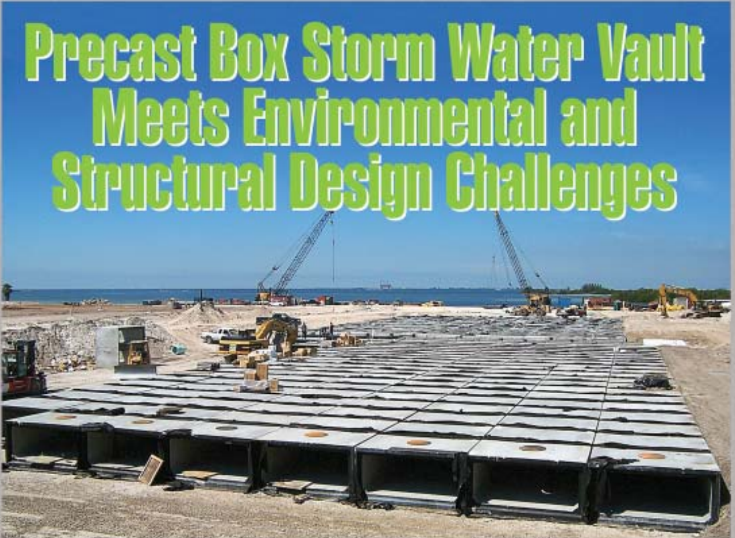
Aerial view of 65,000 cubic-foot vault system.