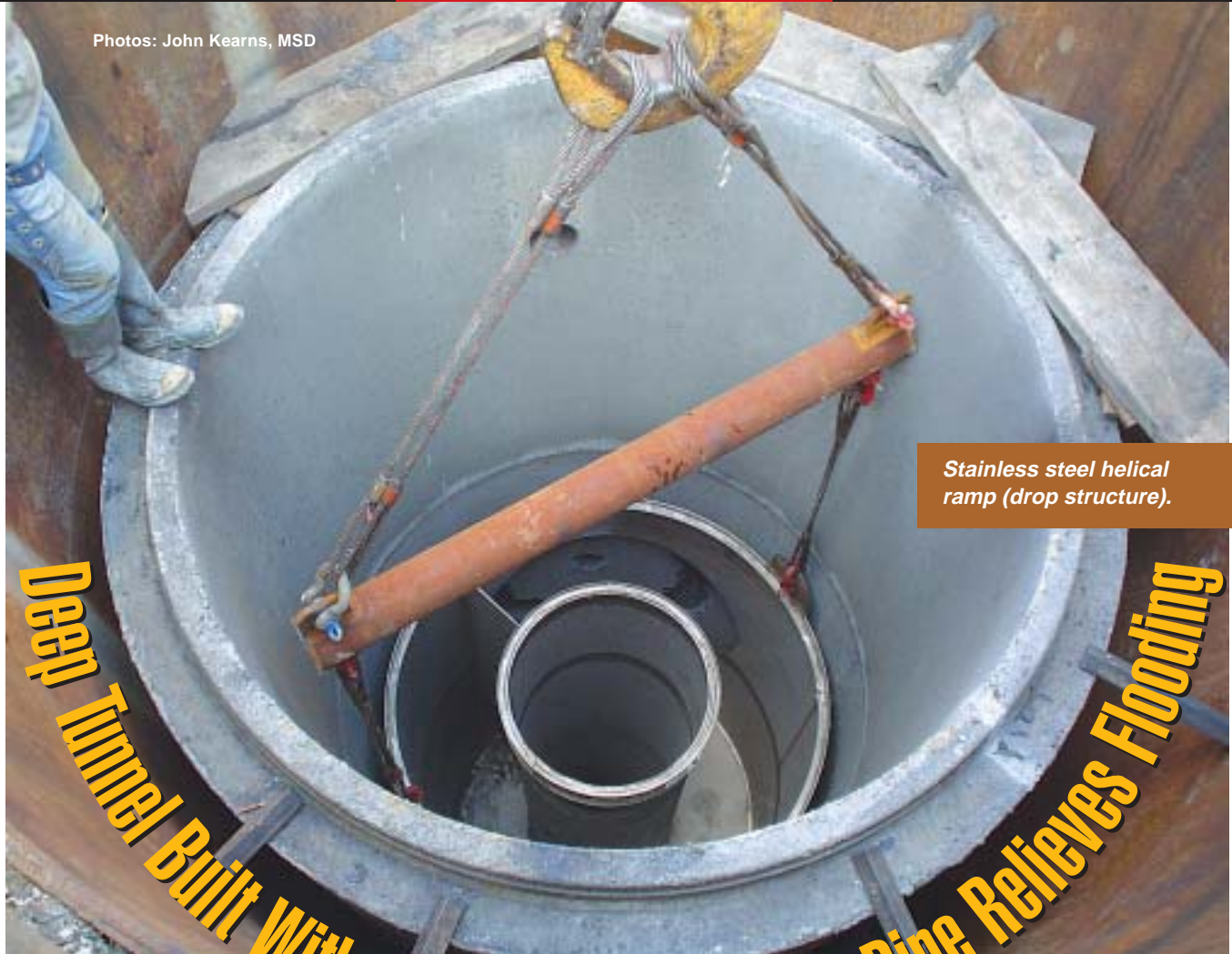
Stainless steel helical ramp (drop structure).