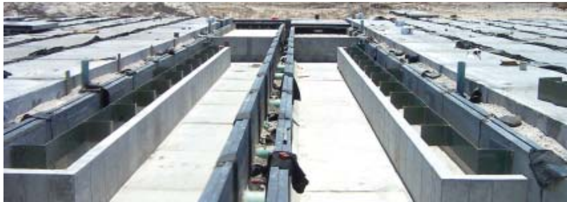
3,864 feet of 10-foot x 4-foot precast concrete box sections and 256 feet of 10-foot x 4-foot precast concrete three sided box sections with lids.

The final design consisted of 3,864 feet of 10-foot x 4-foot precast concrete box sections and 256 feet of 10-foot x 4-foot precast concrete three-sided box sections with lids. The vault system was designed assuming no cover. In total, the system now occupies an area of approximately 1.4 acres. The Hydro Conduit Division of Rinker Materials’, Plant City Florida