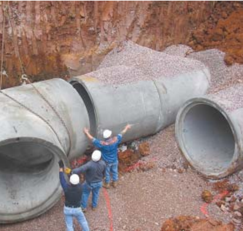
84-inch diameter RCP with depth of cover to top of pipe ranging from 20 to 25 feet.

was closed for approximately three months, the failure disrupted businesses in the area for over half a year. This was too long for some to bear and they relocated. No good has come out of this nationally recurring infrastructure problem of unplanned flexible pipe failures or replacements after only a few decades of service. The attraction to save a few thousand dollars on a job of this magnitude 25 years ago by specifying