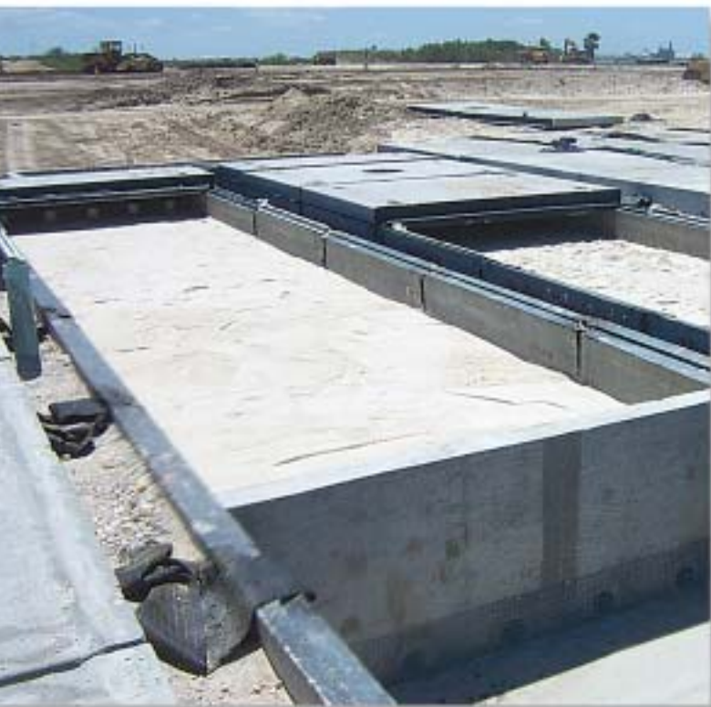
Three-sided boxes designed to hold a special sand media filter.

Contracting Company of Tampa, Florida started construction of the storm water detention system in January, 2005. Chapman reached substantial completion of the system by May, 2005, and did not encounter any major obstacles during construction.