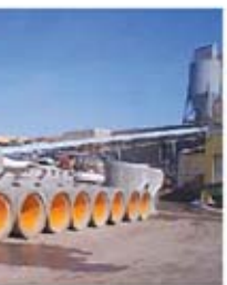
Pipe installed through I-beams.

Hanson Pipe & Products, Inc. is a diversified manufacturer of concrete pipe and a variety of supporting products including manholes, drainage structures, box culverts, bridge components, retaining walls and concrete block. Its plant locations throughout North America enable the company to serve the most rapidly growing parts of the U.S. and Canada. Hanson is an international building materials company. It is one of the world's largest producers of construction aggregates, concrete gravity and pressure pipe, precast concrete, and is the leading manufacturer of facing bricks in Europe. See www.hansonconcreteproducts.com for details.