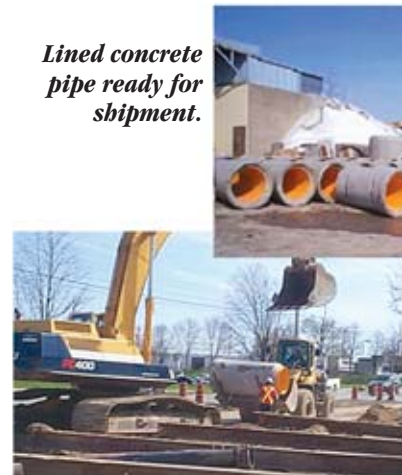
Lined concrete pipe ready for shipment.

more like a railway tie because of the build up of debris on it. The lodged timber in the flow-through manhole created turbulence and generated H_2SO_4 . These two factors contributed to the corrosion in the manhole and left an unstable situation which the City discovered as they entered the structure. When lowered into the manhole, the inspector reached for the ladder rungs and discovered the reinforcing steel was more than accessible to his hand. Considering the level of corrosion, the City took action to cover the flow with some piping, and then fill in the manhole with concrete. One can speculate that conditions in this manhole had contributed significantly to the premature deterioration of the sani-