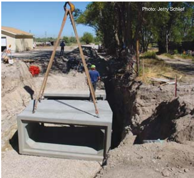
A specially constructed precast section provides for a change in the outfall alignment.

Utah's second largest city, West Valley City, has seen significant growth. The population has increased by 25 percent since the last census to a total of nearly 114,000 residents. Lately, City projects have included the 12,000-seat Olympic Hockey Arena and a 20,000 seat outdoor amphitheater. One of the City Engineering Department's more significant achievements has been the establishment of its Storm Water Utility. Initiated in 2001, the Storm Water Utility has helped the city deal with the EPA requirement to use Best Management Practices with regards