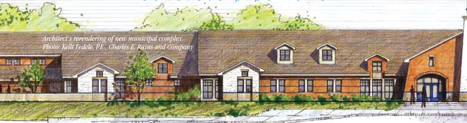
Architect's rendering of new municipal complex.