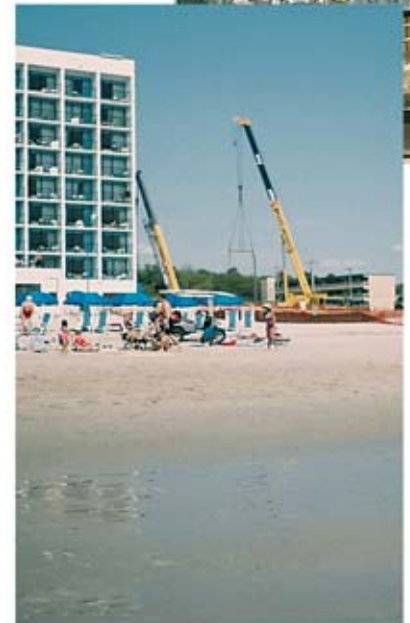
Cleaner shores with elimination of small storm sewers.