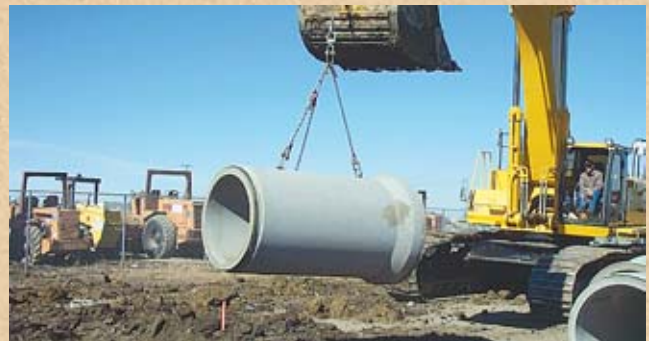
Concrete pipe designed to last 100 years.

Sanitary sewers can and do perform well when constructed with concrete pipe. Even if a liner is required in a situation where the effluent is acidic and has the potential to corrode concrete, the initial cost of such a system should not be a deterrent, if municipalities want a sewer system that will perform as required, and to secure future funds for infrastructure based on asset management plans driven by GASB 34. Standard Installations alone are proving to be able to reduce the installation costs of construction projects significantly. For sanitary sewers that are expected to last 100 years or more, there is no doubt that a concrete pipe sanitary sewer would meet that target and likely keep on functioning for many more years. It only makes sense that concrete