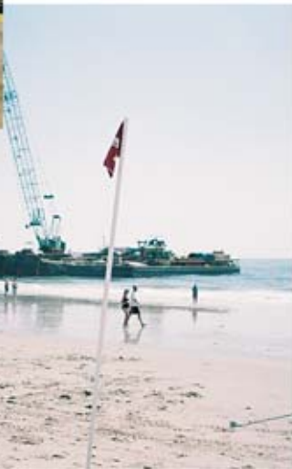
Storm water carried under the beach to discharge 1,100 feet offshore. ▼

feet of twin 60-inch diameter Class III reinforced concrete pipe for the landward contract of the project. All pipe units were supplied with O-ring rubber gaskets to provide watertight joints and restrict the migration of fines into the sewer lines.