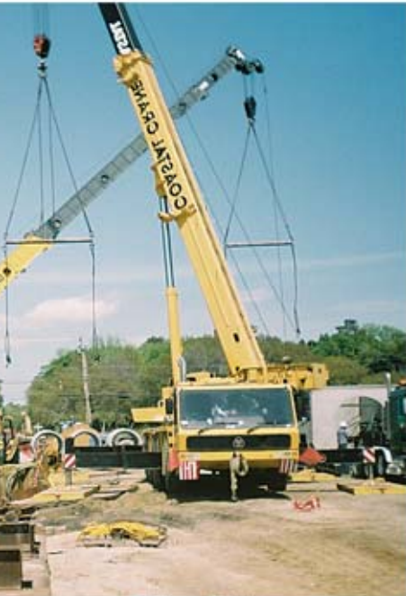
Installation of twin 60-inch diameter RCP storm sewer.

Greenwall Construction Services Inc. of Myrtle Beach was responsible for acquiring and installing the product for the $1.3 million landward side contract. Mysener Marine of Tampa, Florida was contracted at $4.3 million to install the precast concrete cylinder pipe on the ocean side. Project engineering was carried out by DDC Engineering of Myrtle Beach. ☺