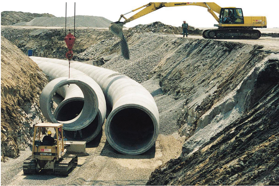
Nesting large RCP on radius.

the legal responsibility to determine whether or not the product being specified will perform its intended function for the specific project in which the design is performed. Therefore, before specifying a particular product, the engineer must be aware of the characteristics, applications, potential deficiencies and limitations of the product. If the product is determined to have been unsuitable and damages result, the engineer may be deemed negligent and damages will be assessed against him.