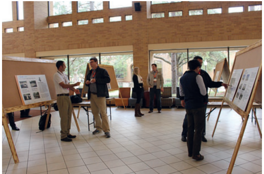
Technical Poster Session at 2016 ACPA Pipe School and Pipe Show – Knowledge-sharing of North American and global issues and solutions.

In 2015, the ACPA worked with several state and regional concrete pipe associations in the USA and established a Unified Training Program for members and guests. The North American concrete pipe industry has a professional force that is highly skilled (among other things) in safety, production, quality, sales, management, and developing/updating Standards and specifications. The focus of the program is rallying local concrete pipe association members by ACPA Regional Engineers who help execute industry-wide training that focuses on technology and experience exchange along with building professional relationships. This is a key program for sharing information and knowledge from colleagues in other countries that has relevance on the production of precast prod-